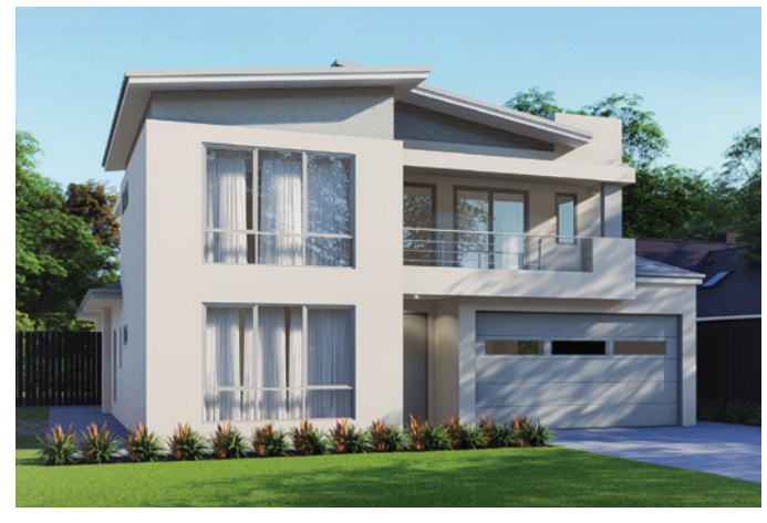
CONTEMPORARY ALTERNATIVE ELEVATION