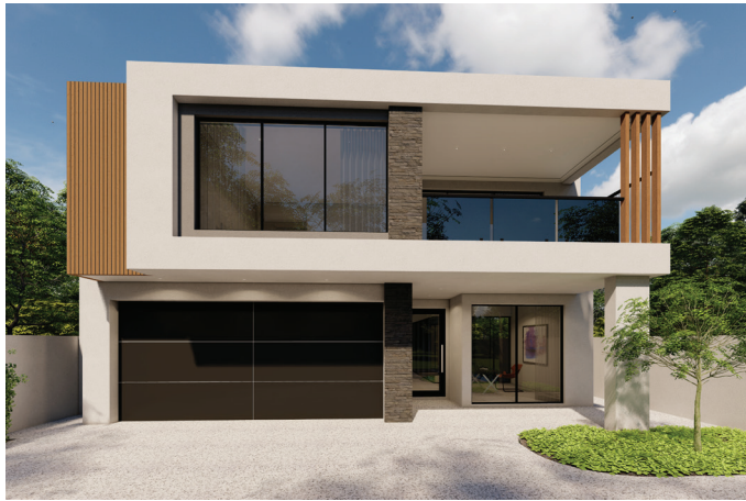
CONTEMPORARY ALTERNATIVE ELEVATION