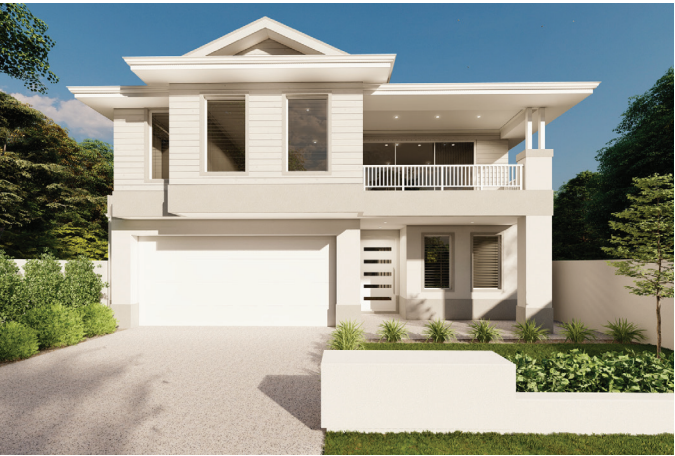
HAMPTONS ALTERNATIVE ELEVATION